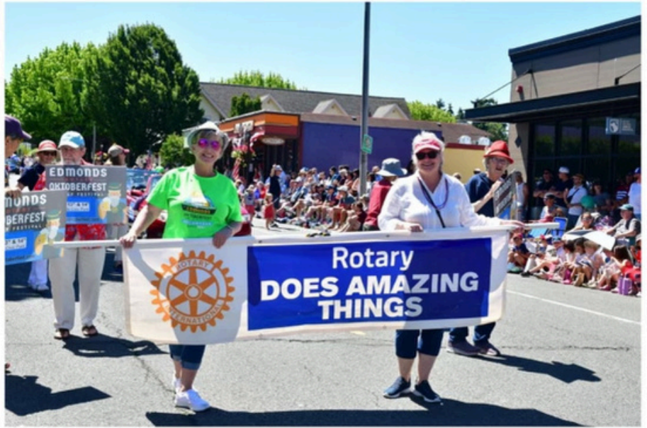
Rotary Club of Edmonds promoted its September Oktoberfest event.

This was the photo that appeared on My Edmonds News.